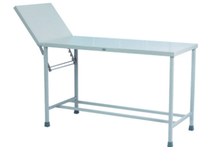
Model No 204