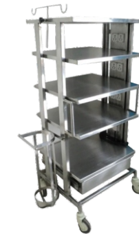
Model No 505 MONITOR TROLLEY S.S