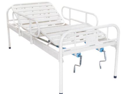
Model No 134 MANUAL FOWLER BED 2 FUNCTION (CLASSIC)