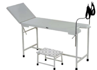
Model No 303