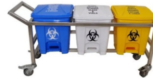
Model No 710 WASTE CARRYING TROLLEY S.S