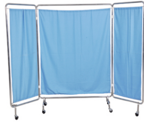
Model No 702 BED SIDE SCREEN S.S / M.S SIZE : H 1675mm X W 2440mm