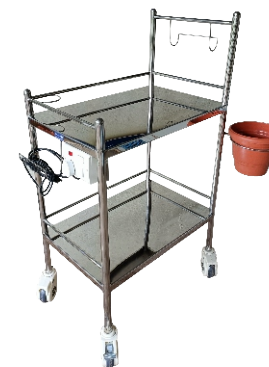
Model No 605 E.C.G MACHINE TROLLEY - S.S Available in Various Sizes