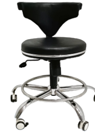
Model No 705 SURGEON CHAIR Hydraulic Movement