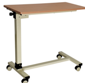
Model No 614 ○ ● ● ADJUSTABLE BED SIDE TABLE SCREW MECHANISM