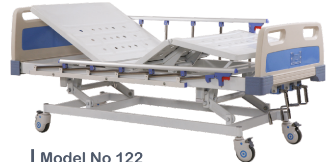
Model No 122 MANUAL ICU BED 3 FUNCTION (DELUXE)