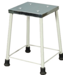
Model No 509 BED SIDE STOOL WITH S.S TOP SIZE : L 405mm X W 405 mm X H 455mm