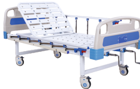
Model No 133 MANUAL FOWLER BED 2 FUNCTION (ECONOMY)