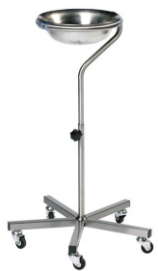
Model No 505 BOWL STAND SINGLE - S.S SIZE : H 840 mm X D 355 mm