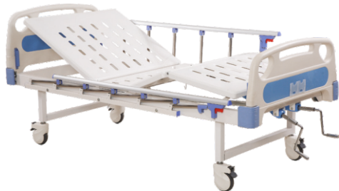
Model No 132 MANUAL FOWLER BED 2 FUNCTION (DELUXE)