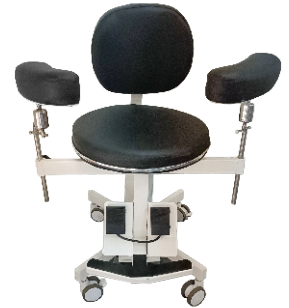
Model No 706 SURGEON CHAIR Motorized Movement