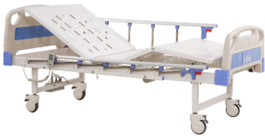
Model No 131 MOTORIZED FOWLER BED 2 FUNCTION (PREMIUM)