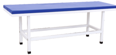
Model No 152