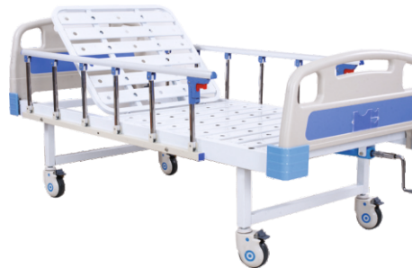
Model No 143 MANUAL SEMI FOWLER BACKREST BED 1 FUNCTION (ECONOMY)