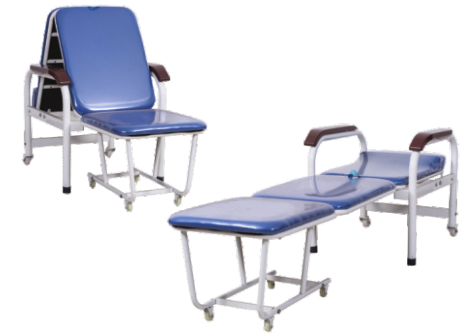
Model No 154