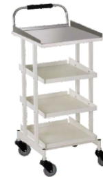
Model No 503 MONITOR TROLLEY M.S with .SS Top