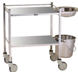
Model No 603 DRESSING TROLLEY - S.S Available in Various Sizes