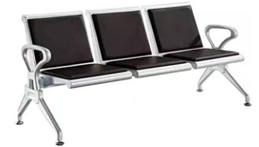
Model No 717 3 SEATER CHAIRS - CUSHION