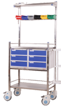
Model No 501 EMERGENCY CRASH CART - S.S