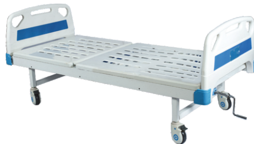
Model No 142 MANUAL SEMI FOWLER BACKREST BED 1 FUNCTION (DELUXE)