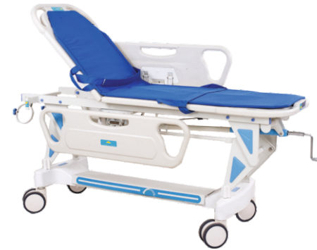
Model No 403 ABS PATIENT TRANSFER TROLLEY