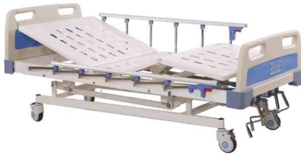
Model No 103 MANUAL ICU BED 5 FUNCTION (DELUXE)