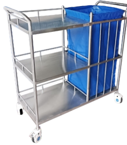
Model No 701 SOILED LINEN TROLLEY BIG - S.S SIZE : L 790mm W 560mm X H 1030mm