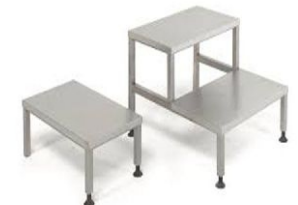
Model No 510/11 SINGLE STEP STOOL - S.S / M.S SIZE : L 450mm X B 225mm X H 225mm DOUBLE STEP STOOL - S.S / M.S SIZE : L 450mm X B 400mm X H 400mm