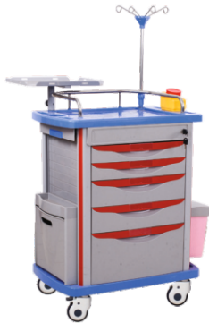
Model No 500A ABS EMERGENCY TROLLEY