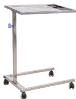
Model No 606 MAYO'S TROLLEY - S.S SIZE : L 560mm X W 445mm X H 810 to 1270mm