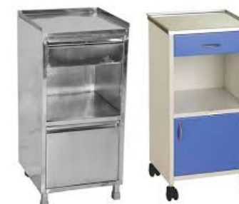
Model No 616 BED SIDE TROLLEY - M.S / S.S SIZE : L 460mm X W 450mm X H 820mm