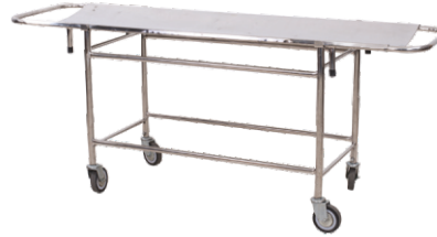
Model No 402 STRETCHER ON TROLLEY - SS SIZE : L 2030mm X W 610mm X H 870mm