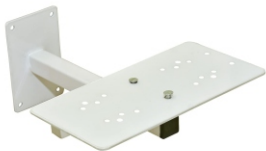
Model No 712 MONITOR STAND Fixed Type