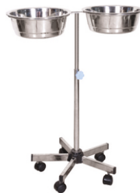
Model No 506 BOWL STAND DOUBLE - S.S SIZE : H 840 mm X D 355 mm