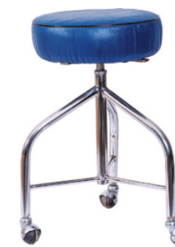
Model No 508 REVOLVING STOOL - S.S SIZE : W 290mm X H 425mm to 675mm