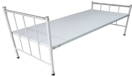
Model No 151