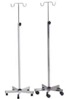
Model No 506 SALINE STAND - M.S / S.S