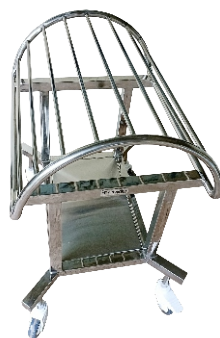
Model No 613 LEAD APRON TROLLEY