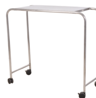
Model No 610 OVER BED TABLE - S.S