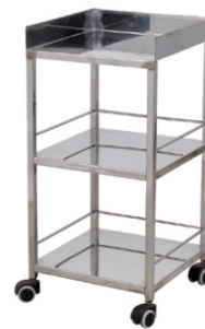
Model No 604 BED SIDE TROLLEY - S.S Available in various sizes