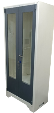
Model No 709 CUBORDS - M.S