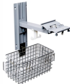
Model No 714 MONITOR STAND Height Adjustable with Basket