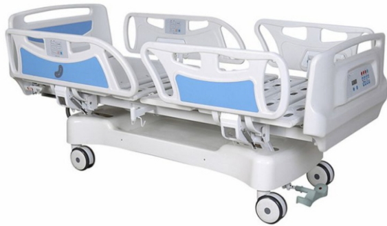
Model No 100 MOTORIZED ICU BED 5 FUNCTION (EXCEL PLUS)