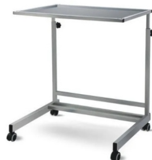
Model No 607 MAYO'S TROLLEY - S.S SIZE : L 560mm X W 445mm X H 810 to 1270mm