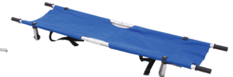
Model No 404 ALUMINIUM FOLDING STRETCHER