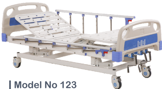
Model No 123 MANUAL ICU BED 3 FUNCTION (ECONOMY)