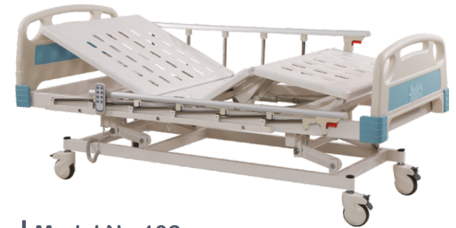
Model No 102 MOTORIZED ICU BED 5 FUNCTION (PREMIUM)