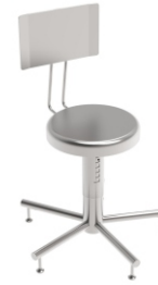
Model No 704 SURGEON CHAIR Complete S.S