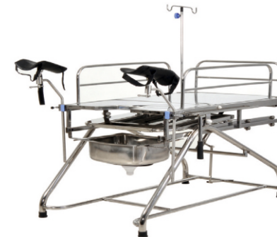
Model No 302

MOTORIZED OBSTETRIC LABOR & RECOVERY BED - 3 FUNCTION