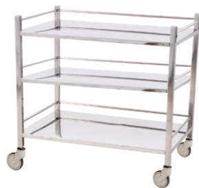
Model No 602 INSTRUMENT TROLLEY - S.S Available in various sizes