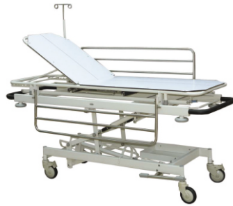
Model No 401 HYDRAULIC TRAUMA CARE RECOVERY TROLLEY