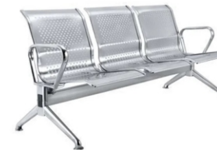
Model No 716 3 SEATER CHAIRS - S.S