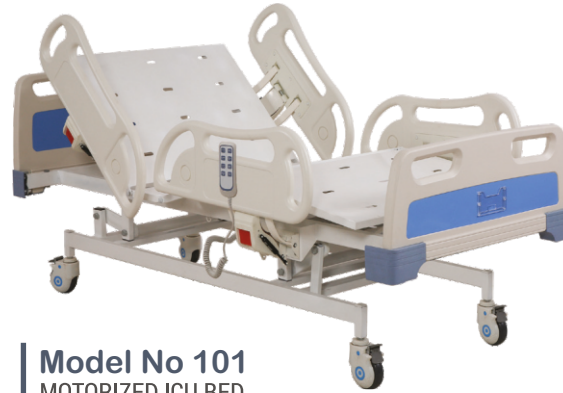
Model No 101 MOTORIZED ICU BED 5 FUNCTION (EXCEL)