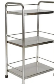
Model No 615 BED SIDE TROLLEY - S.S SIZE : L 460mm X W 450mm X H 820mm