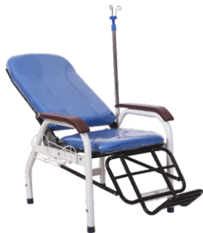
Model No 205