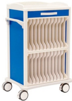
Model No 708 ICU FILE SHIFTING TROLLEY