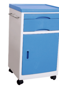
Model No 617 BED SIDE LOCKER ABS SIZE : L 445mm X W 415mm X H 770mm