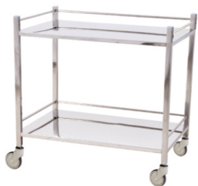
Model No 601 INSTRUMENT TROLLEY - S.S Available in various sizes