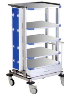
Model No 504 MONITOR TROLLEY M.S