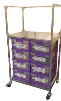
Model No 609 PHACO TROLLEY - S.S Available in Various Sizes