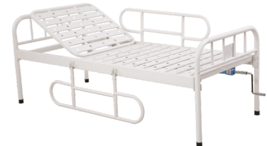
Model No 144 MANUAL SEMI FOWLER BACKREST BED 1 FUNCTION (CLASSIC)