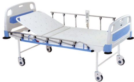
Model No 141 MOTORIZED SEMI FOWLER BACKREST BED 1 FUNCTION (PREMIUM)