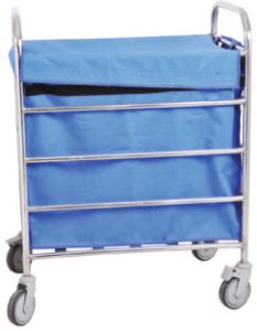
Model No 700 SOILED LINEN TROLLEY BIG - S.S SIZE : L 790mm W 560mm X H 1030mm