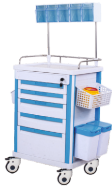
Model No 500B ABS ANESTHESIA TROLLEY