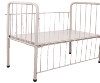
Model No 153