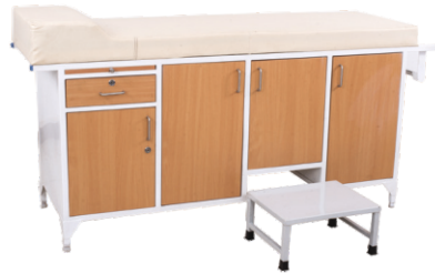
Model No 201