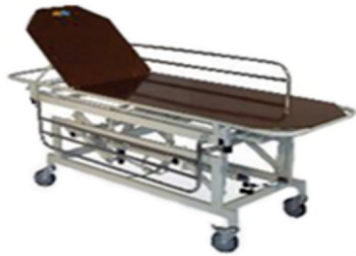
Model No 400 TRAUMA CARE RECOVERY TROLLEY By Screw Mecahnism