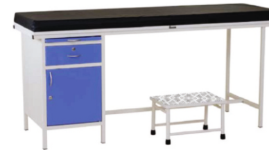
Model No 203