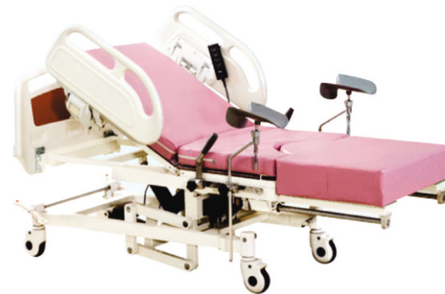
Model No 301

MOTORIZED OBSTETRIC LABOR & RECOVERY BED - 3 FUNCTION