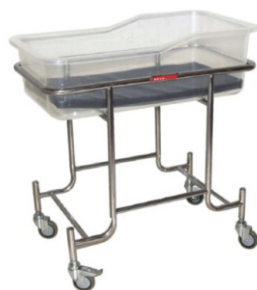
Model No 612 BABY TROLLEY - S.S Size : L 750mm X W 455mm X H 1000mm