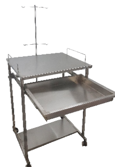
Model No 608 PHACO TROLLEY - S.S Available in Various Sizes