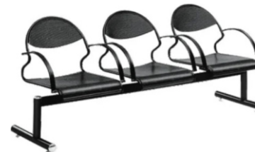
Model No 715 3 SEATER CHAIRS - S.S