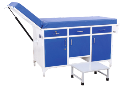
Model No 202