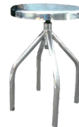
Model No 507 REVOLVING STOOL - S.S SIZE : w 290mm X H 425mm to 675mm