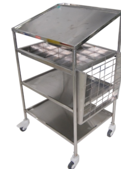
Model No 611 ICU TROLLEY - S.S Available in Various Sizes