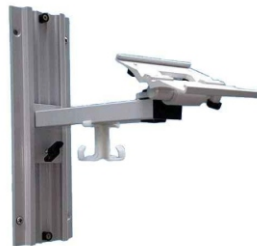
Model No 713 MONITOR STAND Height Adjustable