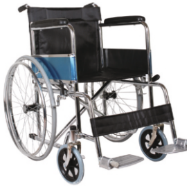
Model No 707 WHEEL CHAIR Folding / Non Folding